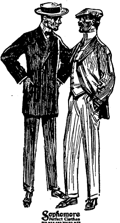
Sophomore Perfect Clothes for men and women